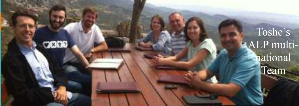
Toshe's ALP multi-national Team

Macedonian police stand in front of a memorial for the victims of a gun battle in Kumanovo, Macedonia just over a week ago. 8 special ops policemen lost their lives and 40 were wounded to stop terrorists whose plans included attacking civilian population targeting large groups. There were an additional 14 casualties from among the terrorists, and others were taken under custody. Please pray for supernatural protection from a surge in ethnic tension as a result of this conflict. Please pray for those who grieve their loved ones. This is the most difficult confrontation with terrorists Macedonia has experienced.