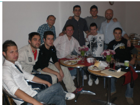
Weekly event! Soooo young...

And as Paul says in Acts 20:24 , " ...my only aim is to finish the race and complete the task the Lord Jesus has given me - the task of testifying to the good news of God's grace. "